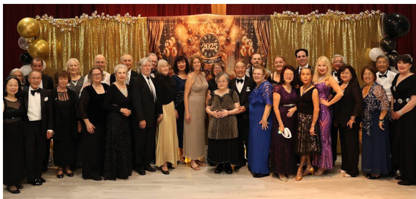
Golden Gate Members at the New Years Gala (above)

The Golden Gate tradition of having our New Year's Eve party a day or two early continues. We had it at Dominic's SF in San Francisco on December 28. It sold out early and everyone had a great time. Thanks to all who attended.