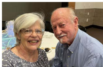
President and 2025 Queen Elect