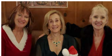
Christmas at the Grange

We had a great turnout for our Christmas Party on December 15th. The holidays are always a special time to enjoy time spent with friends.