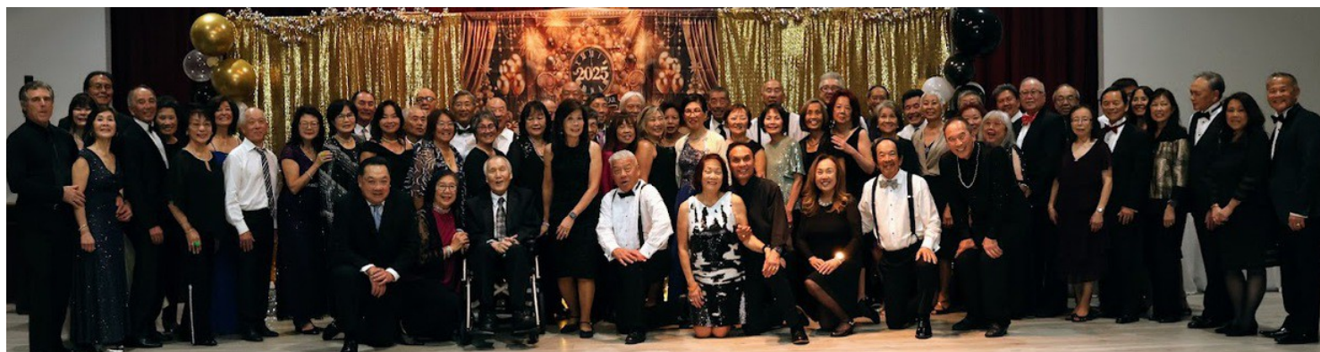
Guests at the New Year Gala (below)