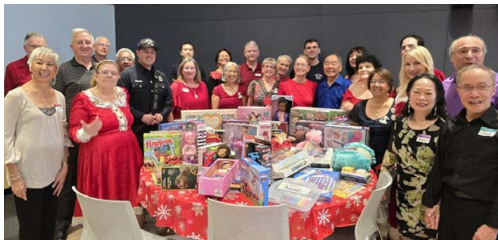
December Dance Toys for Tots

Often we think that the Rules Committee representatives are the people to encourage members from their chapters to dance, but if you have competed please join them and make the effort to encourage others in your chapter. The more the merrier!