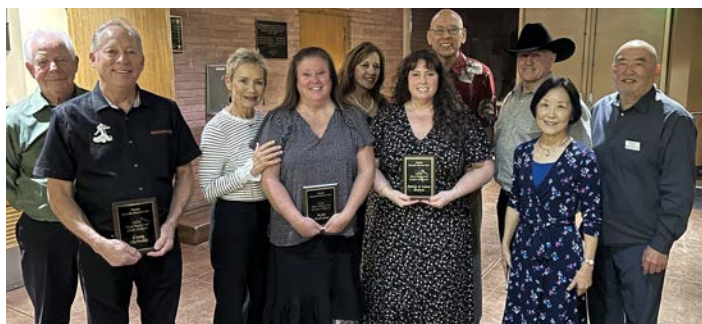
Most Improved Dancers of 2024 stand with 2023 winners (above)