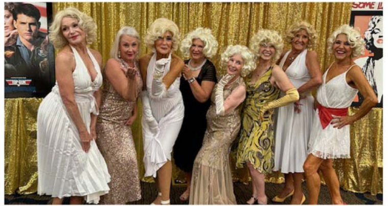
(Some Like It Hot) and a bunch of handsome wannabe Tom Cruises. (Top Gun)

Sunday Afternoon celebrated the Zoo with a dance