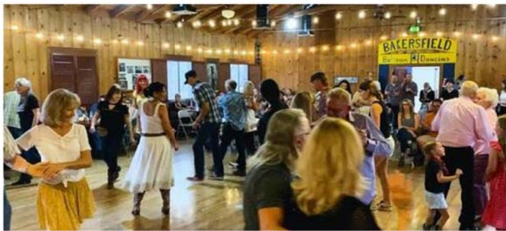
Line Dance Fest at the Grange

We continue to hold dances every Friday night at the Fairfax Grange from 7:00 to 9:00 pm with a cost of only $5 per person.