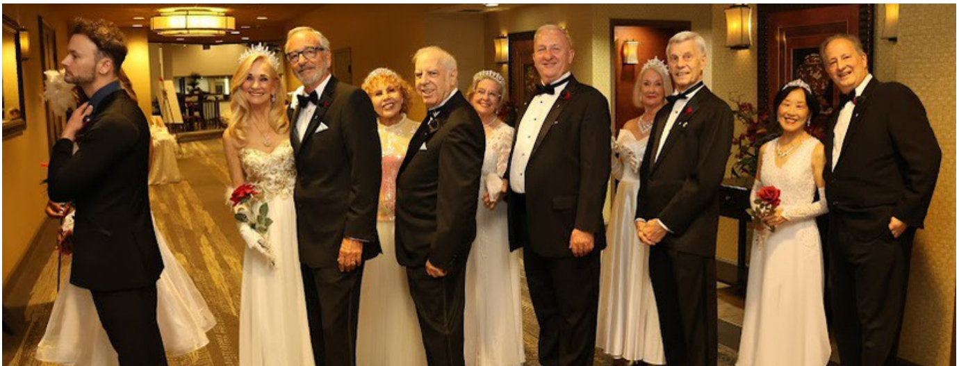
San Fernando Valley Coronation Queen and Escort Lineup

Wouldn’t it be great if every NSD member had a few of some similar cards (all with the same NSD Logo) in their wallet or purse that they could give out in a flash? Wouldn’t it be awesome that some time in the near future you gave one out and someone said “ah... NSD, I recognize that logo from a business card someone texted me last month... or maybe I saw it at my dance studio... in fact I saw it at my instructor’s studio in LA where I fly each month for competition coaching.” Dream big, carry a sales card!