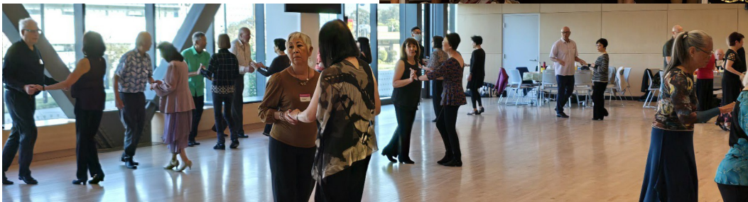
West Coast Swing Lesson (above) and Stroll Along Cha Cha Line Dance (below)